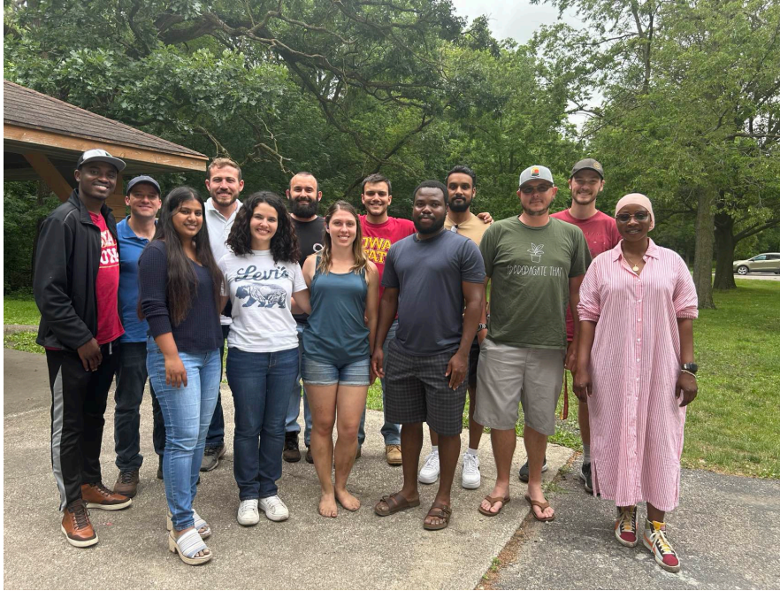
Photo 1. RegenPGC Graduate Education Community Summer 2024 Barbeque.

project. Special professional development workshops and other activities will be organized on an ad hoc basis.